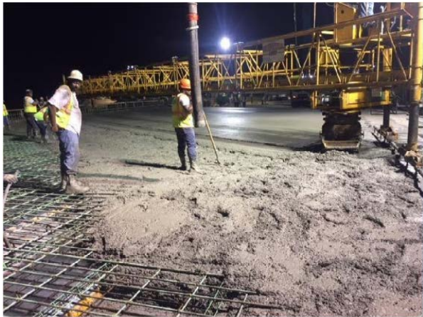
Deck Pouring on Flatshoals Over I-285 Bridge stage 2 on span 2