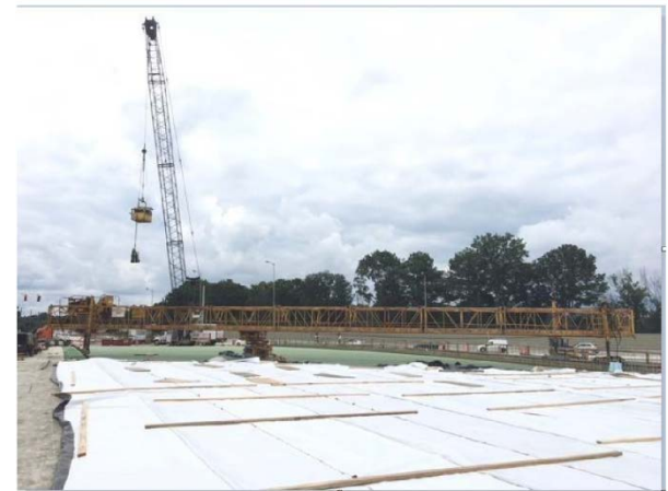
Deck Pouring Completed, covered for curing on Flatshoals over I-285 Bridge stage 2 Span 2