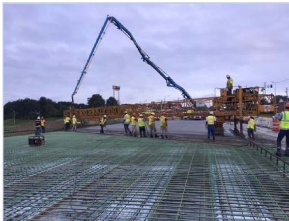
Deck Pouring on Flatshoals Over I-285 Bridge stage 2 Span 2