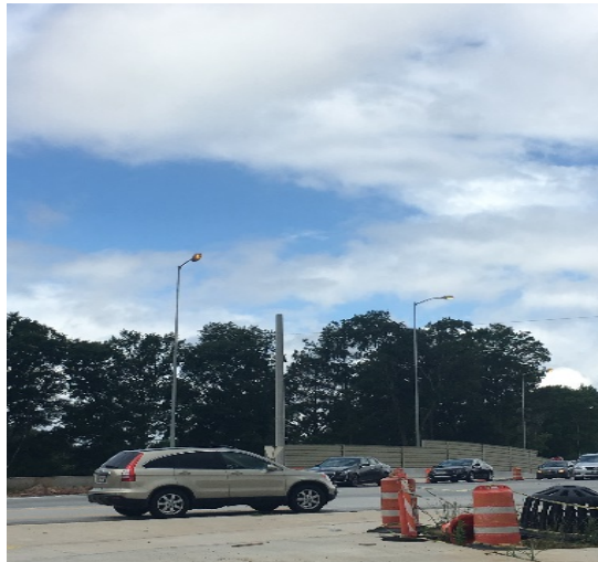
High Mast Lighting