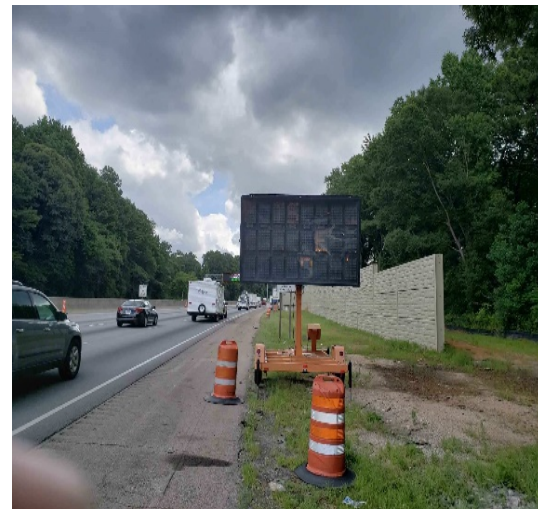
Changeable Message Sign